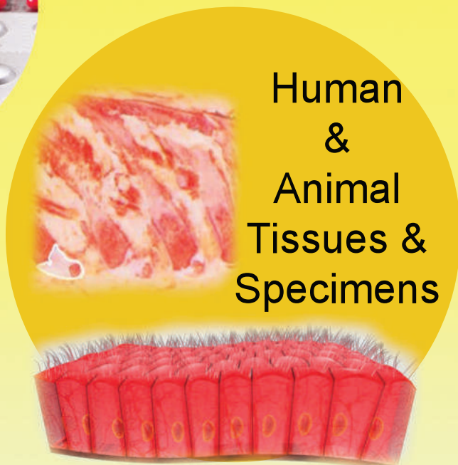
Human & Animal Tissues & Specimens