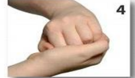
Backs of fingers to opposing palms with fingers interlaced.