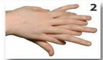
Right palm over back of left hand. Left palm over back of right hand