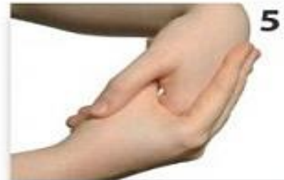
Rotational rubbing of right thumb clasped over left palm and left palm over right palm