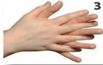
Palm to palm fingers interlaced